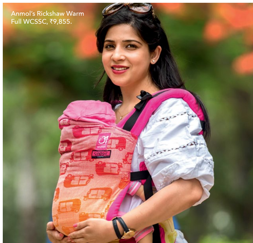
Anmol's Rickshaw Warm Full WCSSC, ₹9,855.

THE TREND of wearing your baby or toddler is fast getting popular in urban India. The concept focusses on carrying your child close so as to encourage skin-to-skin contact, resulting in a range of benefits that ensure a healthier, happier baby. With ergonomic designs, soft fabrics and indigenous patterns, four Indian baby carrier brands are breaking new ground in the country.